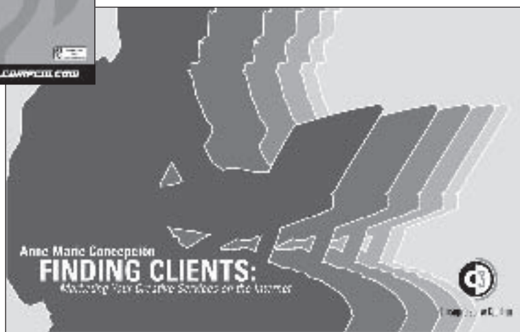
C3 event postcard