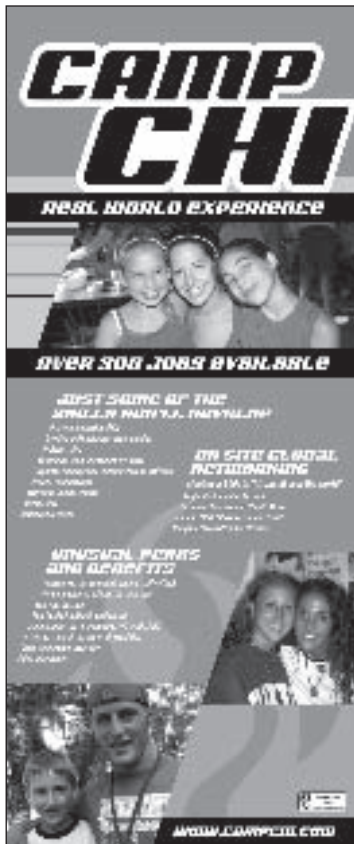
JCC Camp Chi display poster

Contact Jason Feinberg at: 773.477.5139 Email: goblues27@mac.com Web: homepage.mac.com/goblues27