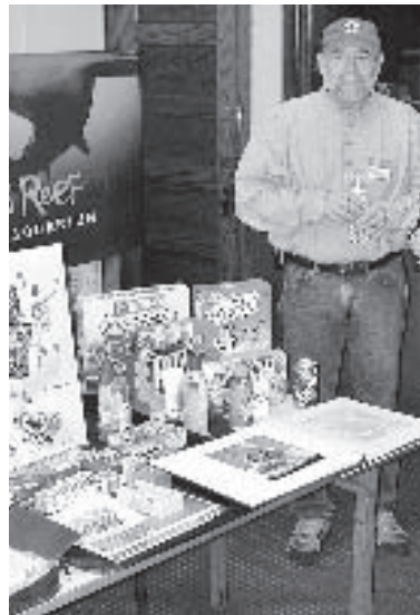
CAPS 57 displays neither headwear nor ketchup. Discuss.