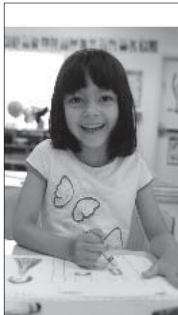
JCC Preschool Brochure spread (above), cover (top right)

thank you for your interest in JCC Early Childhood Services