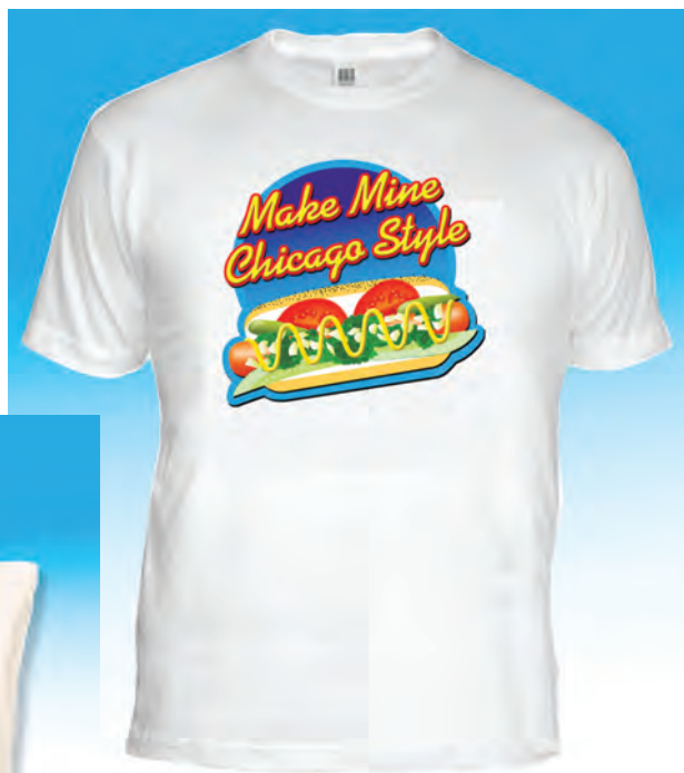
Make Mine Chicago Style: A Chicago-style hot dog or deep dish pizza. Can be ordered on a tote or T-shirt.