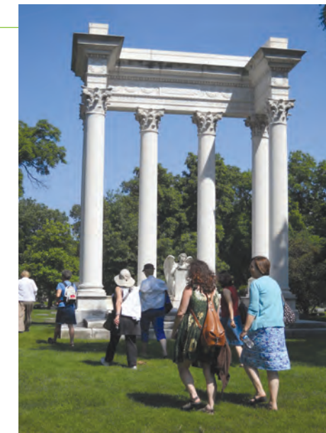
A helpful angel provides directions back to the parking lot

After our tour, the entire group adjourned to nearby Andies Restaurant on Montrose for a Mediterranean dinner and good conversation. The briefest business meeting in C3 history consisted of nomination, unanimous voting and confirmation of the new slate of Board members, with no additional business discussed. And as the surprise recipient could not join us, our announcement of this year's Friend of C3 award is being delayed for an upcoming meeting when he or she is present. So if you're handicapping at home, you can cross off anyone who's face shows up in these pictures.