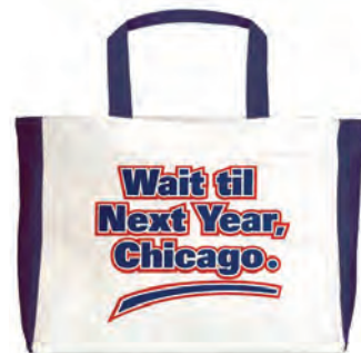
For the Classic Fan: Wait til Next Year, Chicago